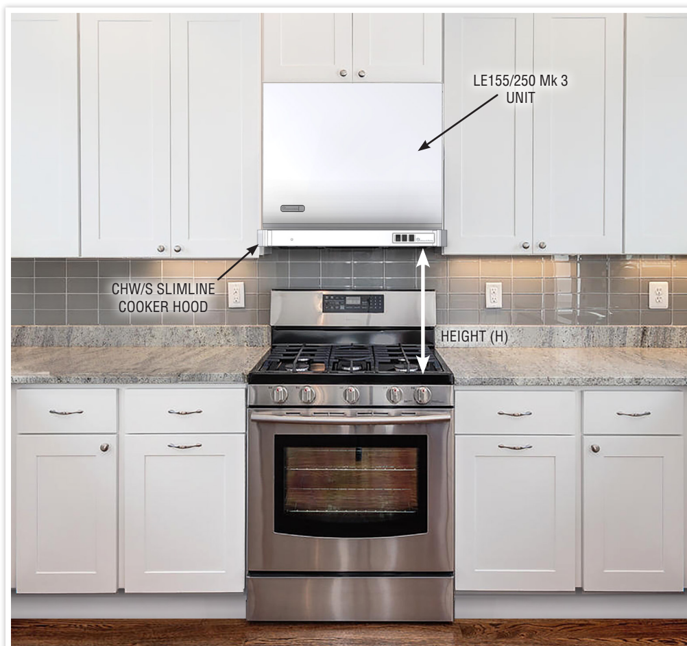
FIGURE 3. COOKER HOOD INSTALLATION