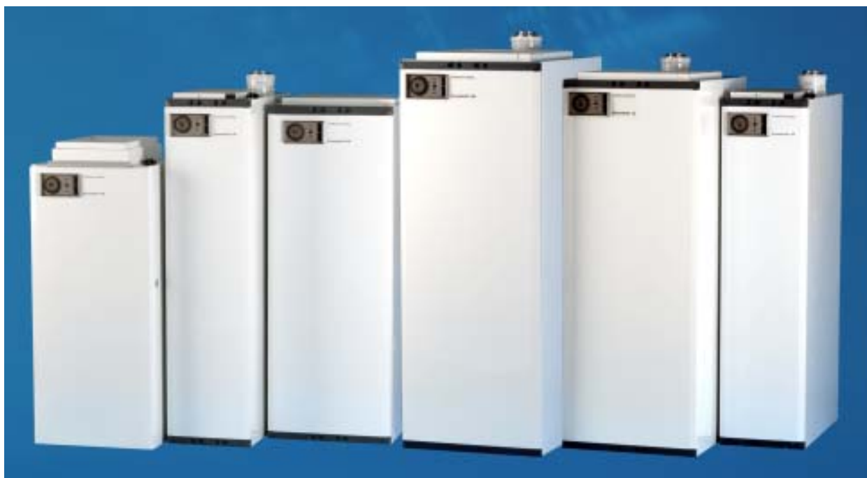
Complete Economaire range - from left to right: Economaire 25; Economaire 31; Economaire 50; Economaire 90; Economaire 65 and Economaire 32

IMPORTANT: IT IS A STATUTORY REQUIREMENT THAT ALL GAS APPLIANCES BE INSTALLED BY COMPETENT PERSONS, (i.e. CORGI REGISTERED INSTALLERS) IN ACCORDANCE WITH THE GAS SAFETY (INSTALLATION AND USE) REGULATIONS (CURRENT EDITION). FAILURE TO COMPLY WITH THESE REGULATIONS MAY RESULT IN PROSECUTION.